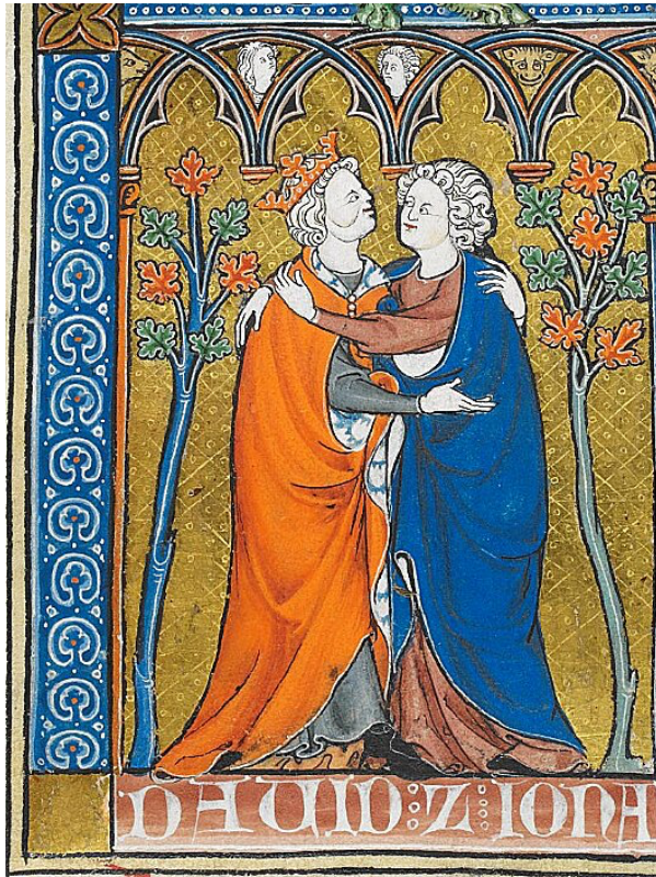
Manuscript illustration. La Somme le roy circa 1300 AD