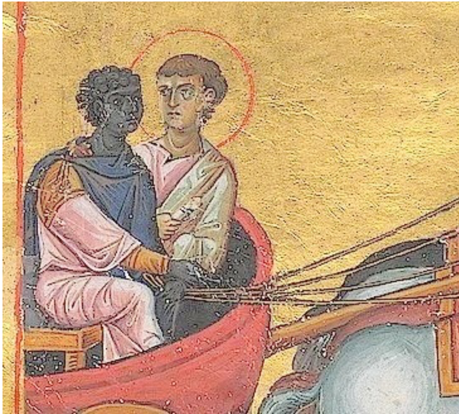
Menologion of Basil II, an 11th-century illuminated manuscript